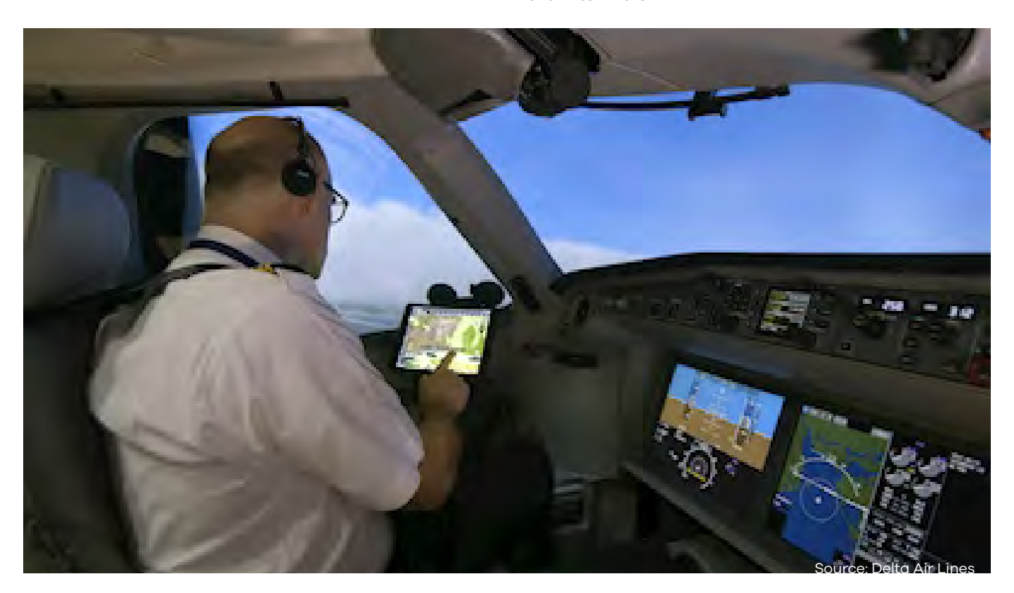
Figure 3: Apps like the Delta Flight Weather Viewer use Passenger Wi-Fi to Enhance the On-board Experience

As a result, several airlines are beginning to take the initiative and exploit the low-hanging fruit that is connectivity-enabled live weather. Delta Air Lines, for example, has built its own iPad-based app, Delta Flight Weather Viewer, which forecasts and then indexes the severity of patches of turbulence. The app benefits from gathering and analysing a vast amount of data points from sensors onboard hundreds of aircraft, all sent via the passenger Wi-Fi system. Thanks to these efforts, Delta is the only airline to have recorded decreased encounters with higher-level turbulence in the last three years. Because of this and the added investment of an in-house meteorology team, it was also the last airline to operate commercial flights in and out of San Juan airport in 2017, despite the threat posed by Hurricanes Irma and Maria, and has been able to restart service at closed airports more quickly than its rivals9.