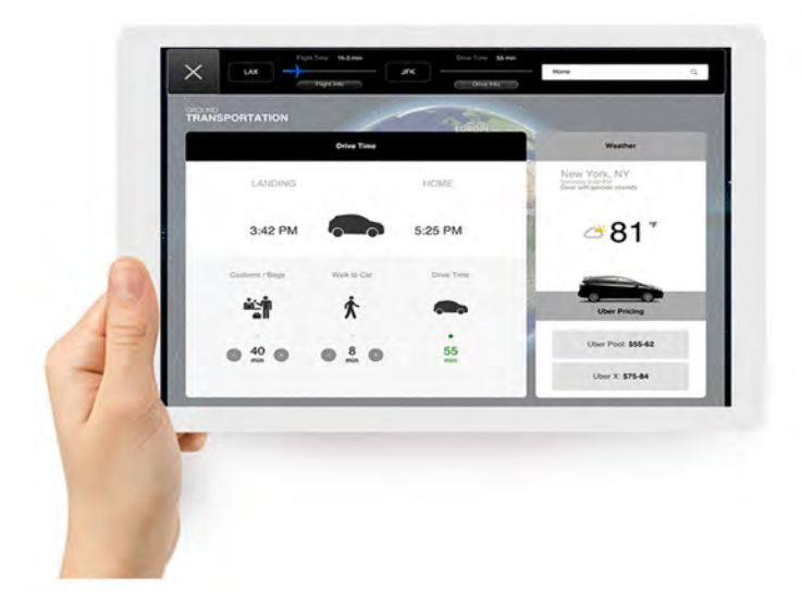
Figure 2: Create Personalized Travel Plans with FlightPath3D's Travel Planner

According to SITA's 2019 Passenger IT Insights survey, the use of on-board technology for entertainment or productivity actively contributes to a positive passenger experience with respondents expressing an average customer satisfaction score of 8.3 out of 10<sup>6</sup>. It follows then that any airline able to take the hassle out of booking onward travel in this way would likely also score highly in NPS surveys.